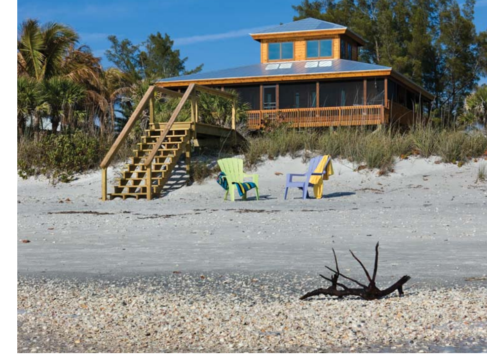
Log Home Producer: International Homes of Cedar, Woodinville, Washington Log Home Builder: Bruce Woithe, Hoot Gibson Construction Co., Placida, Florida Two-story home | Square Footage: 1,868 | Bedrooms: 2 Baths: 2

FIVE SETS OF FRENCH DOORS FLANK THE GREAT ROOM OF THE HOME, ALLOWING EASY ACCESS TO THE OUTDOOR LIVING SPACES AND BRINGING THE GULF